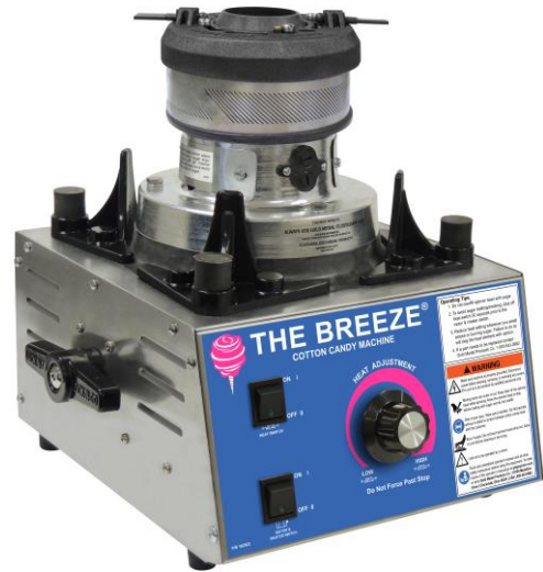
Unit view without Floss Pan