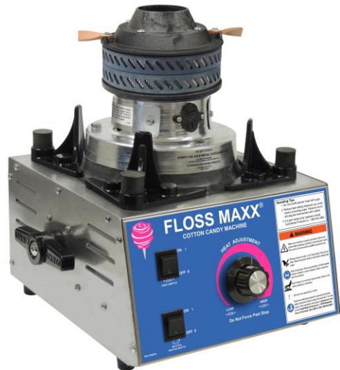
Unit view without Floss Pan