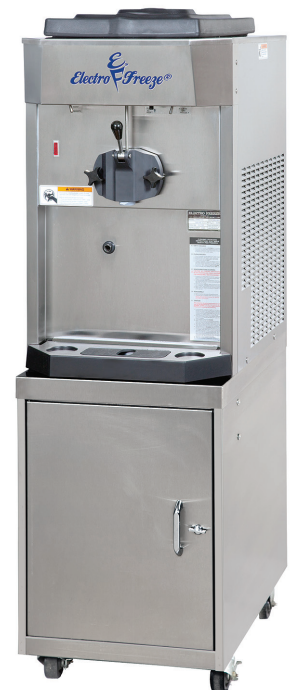
Shown with Optional Cabinet