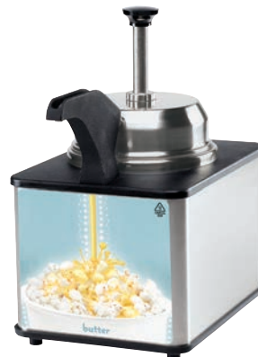
Supreme™ Butter Warmer

Server's SlimLine™ Dry Food Dispensers display and dispense preset portions of up to (4) candies, toppings, or mix-ins in less than 13" of wall space. Control costs with precise portions; color-coded trays identify serving size. Stands are available for countertop dispensing.