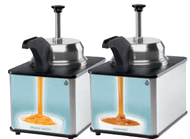
Additional cheese sauce and caramel magnets

Portion Optimization keeps food costs low by minimizing waste and inconsistent servings while providing consistent flavors every day at each of your locations. Pumps dispense 1 oz (30 mL) max portion - reduce portions in 1/8 oz (3.7 mL) increments with gauging collars.